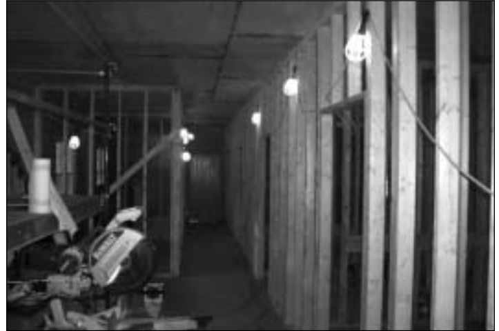
A view of the hallway looking past the bathrooms toward the bedrooms.