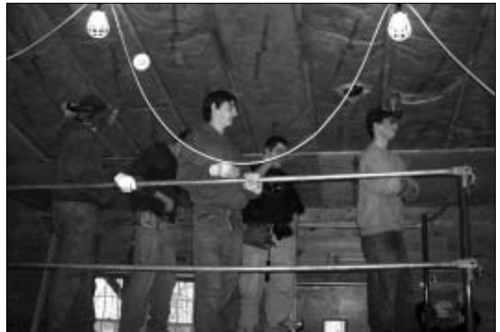
Most of the insulation was completed by the 40 members of General Nash.