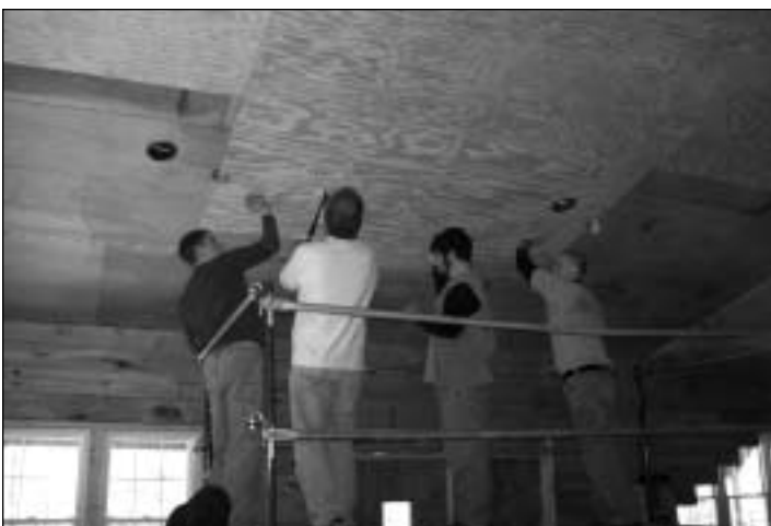
Venture Crew 251 braved the cold temps and installed the beadboard ceiling.