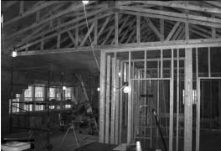
Most of the framing was completed during the month of January.