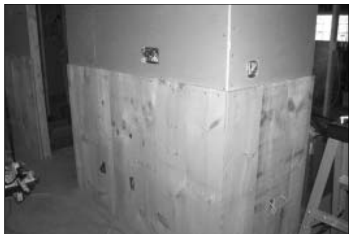
Rough sawn pine boards are installed in public areas.