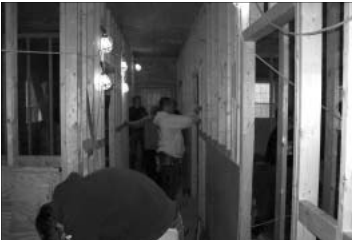
General Nash Chapter comes through again. Drywall and wiring started.